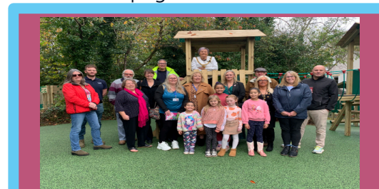
Grassmere Way Play Park - Grand Opening Pillmere Community Association

Town Team are currently leading the Fore Street Public Realm Project (more information on page 18).