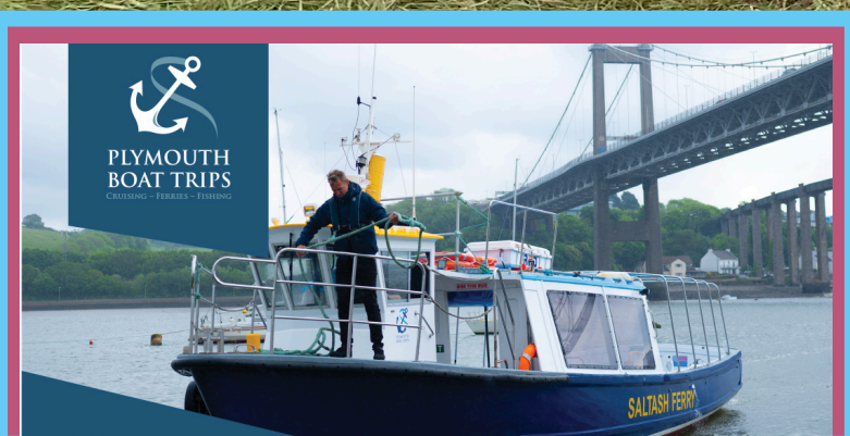
Plymouth Boat Trips