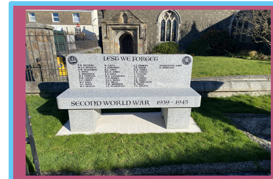
Saltash's Borough War Memorials

SEA has free hire of Isambard House for community talks and workshops on environmental issues and awareness which the public are invited to attend.